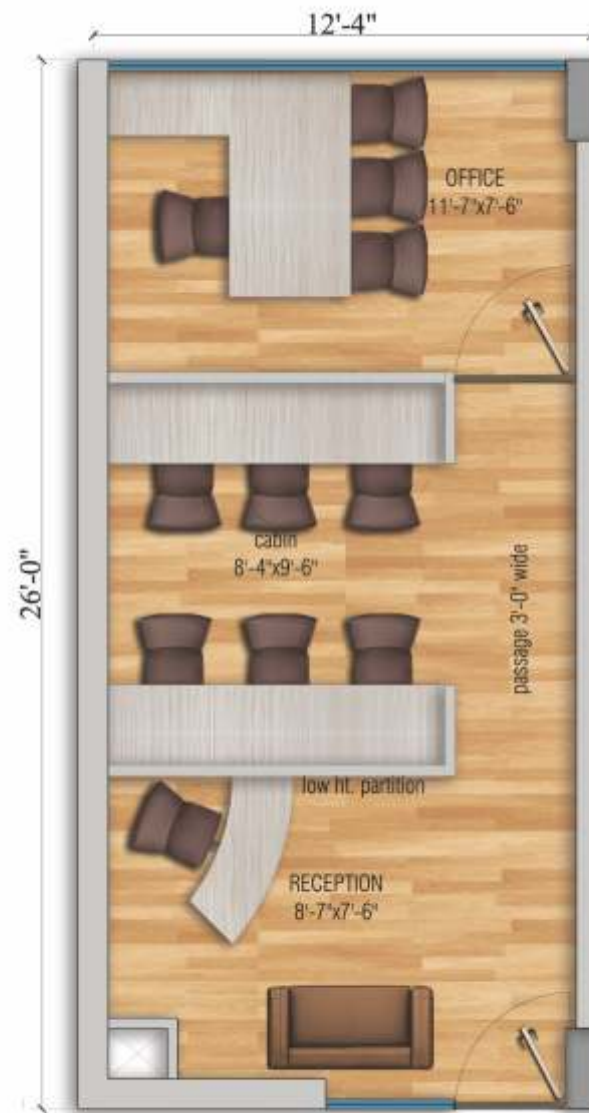
OFFICE TYPE - 2 ( 12'-4" X 26'-0")