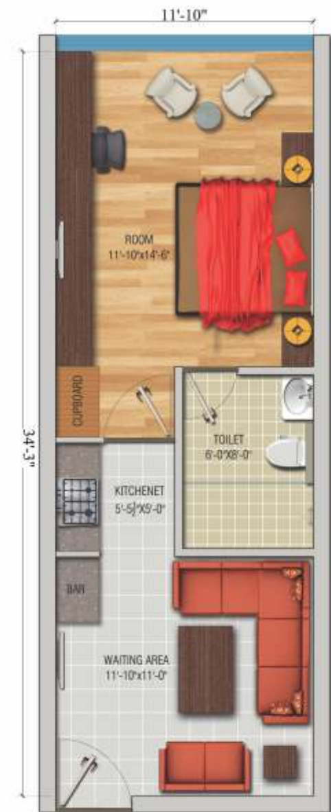
STUDIO - 4 ( 11'-10" X 34'-3")