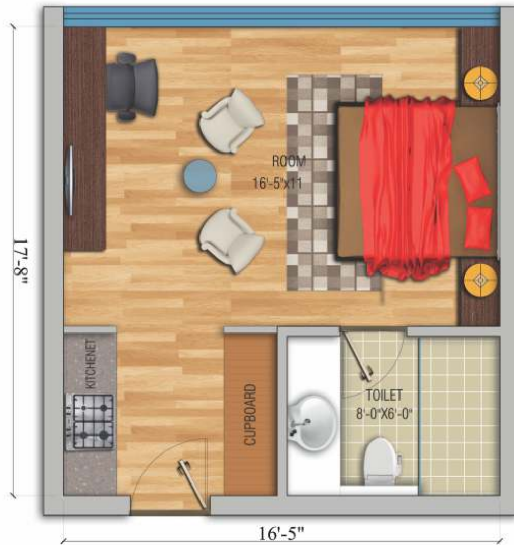
STUDIO-3 ( 16'-5"x17'-8")