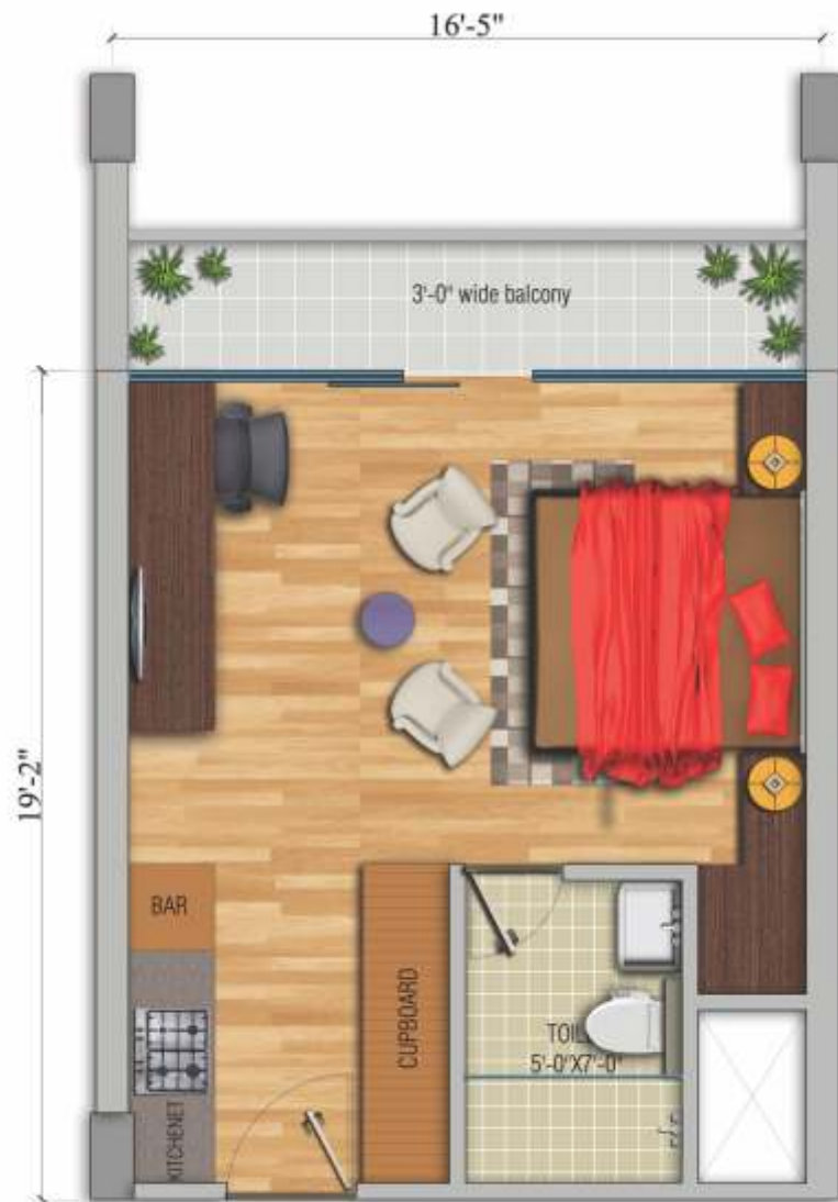
LUXURY OFFICE CUM STUDIO ( 16'-5"x19'-2")