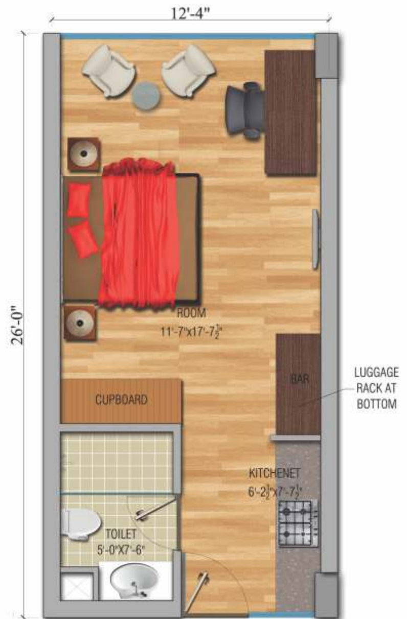
STUDIO-2 ( 12'-4" X 26'-0")