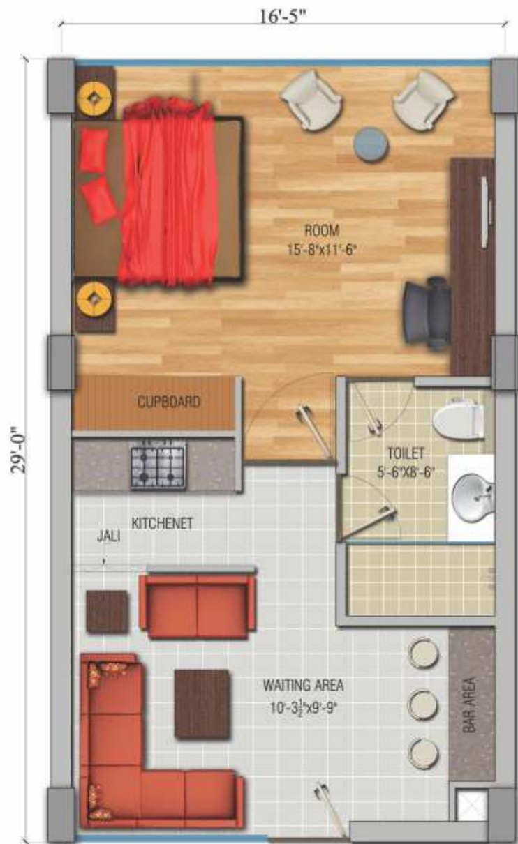
STUDIO-1 ( 16'-5"x29'-0")