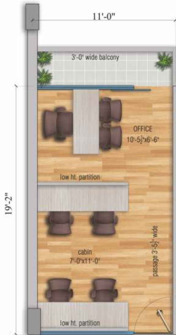
OFFICE TYPE-3 ( 11'-0" X 19'-2")